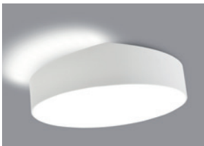
6168 pág. 116