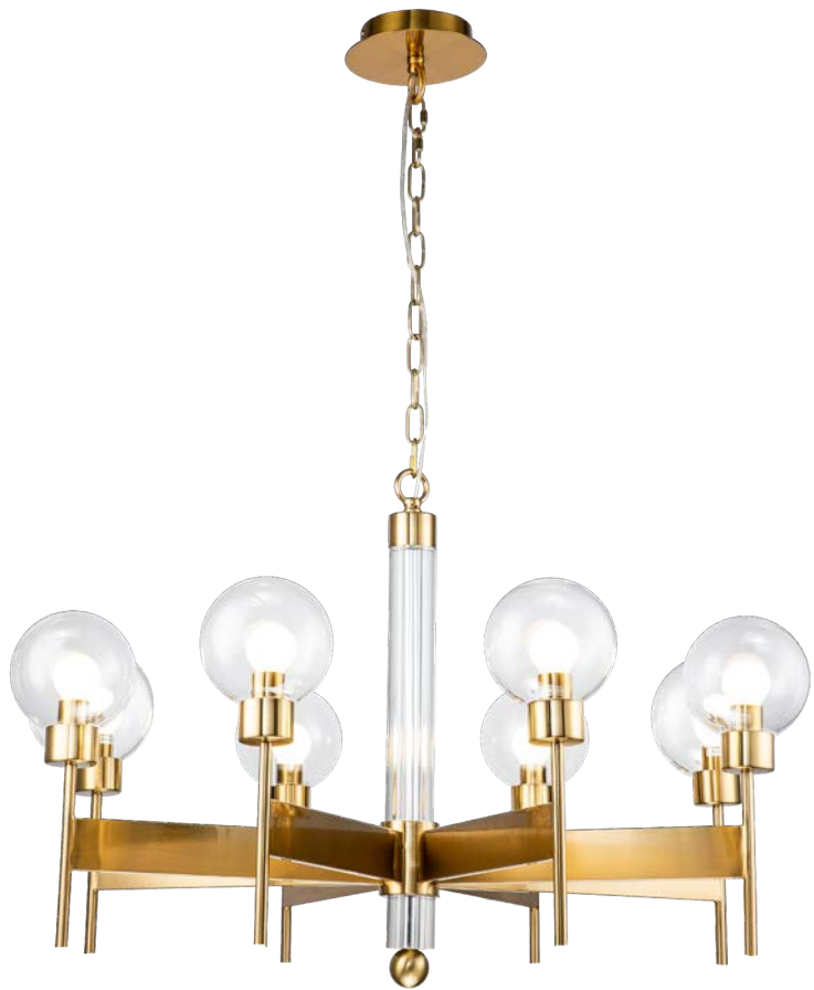
2972-8P D800*H470/1470 8*E14*40W, excluded metal, glass