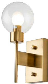
2972-1W D120*W120*H290 1*E14*40W, excluded metal, glass