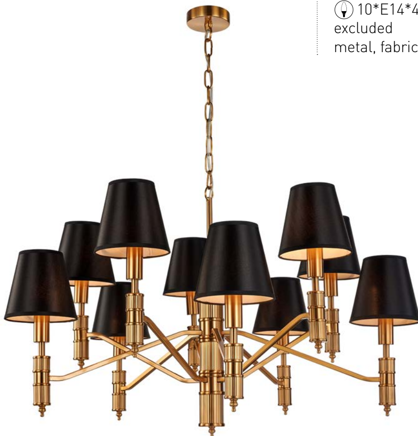
2933-10P D840*H480/1570 ⦿ 10*E14*40W, excluded metal, fabric